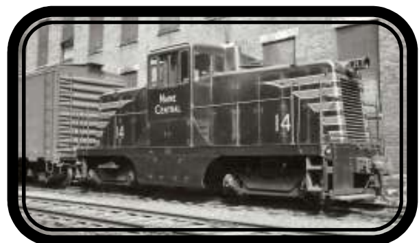
MEC #14 at Bates Mill, sometime in the past.