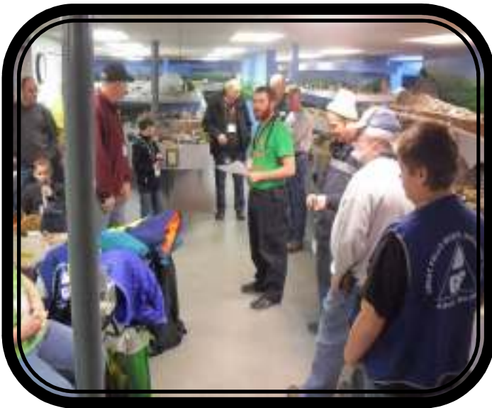
Discussing the just completed operating session, in January 2016

By combining model railroading and dollhouse displays, guests see how these hobbies complement each other. Dollhouse modelers enjoy our scenery, which for them is landscaping. Many model railroaders find small items from the dollhouse hobby which work with model railroading.