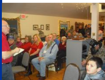
By Paul Lodge

The Christmas party was very well attended. Several families came to enjoy the opportunity to socialize and to sample the varied and delicious food at the pot luck buffet.