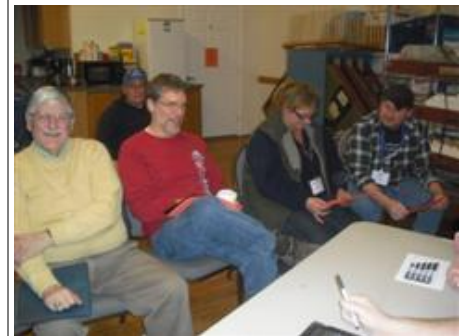
Our Adult Ed Teacher with Real World Experience