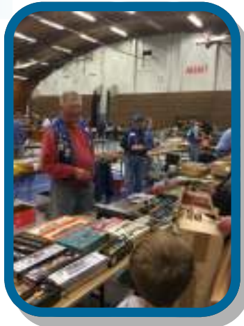
Topsham Show by Tami Paine