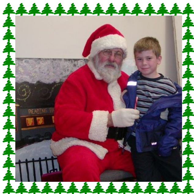
Santa's visit at last year's ExTRAINaganza