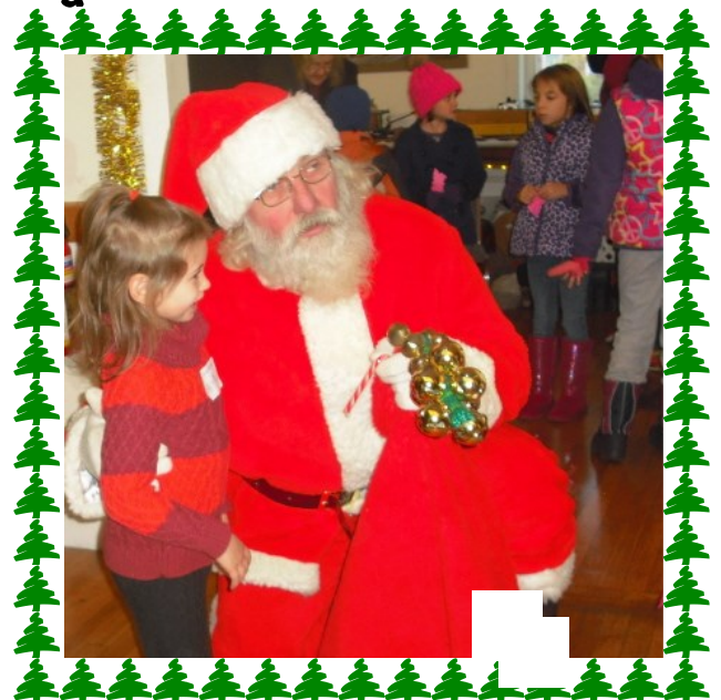
Santa's visit at ExTRAINaganza