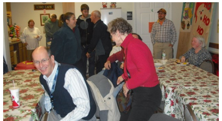
Club Christmas Party