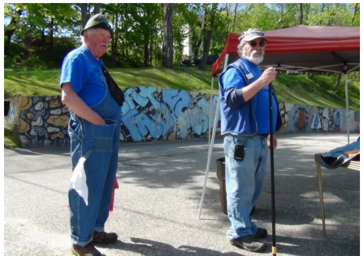
Some more "workers" at last year's Hobo Holiday