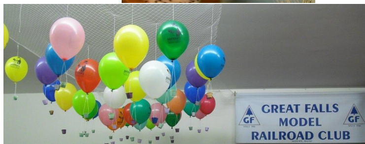
Train set BN 181, for sale in GFMRRRC Gift Shop