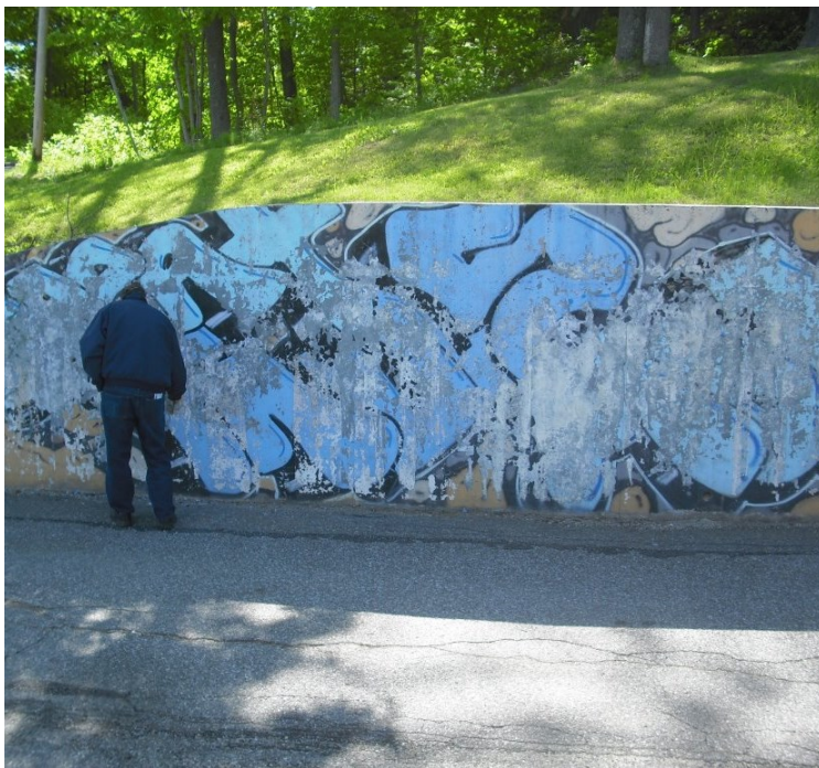
Power washing needs to be completed before the wall is repainted

There was a brief discussion of items which would be appropriate for this fall's air brushing class for "Modeling: The Next Step." Air brushing has been selected for this class because it was the topic most often mentioned by club members who completed the recent interest survey. After more details are worked out for the air brushing class, a schedule will be announced.