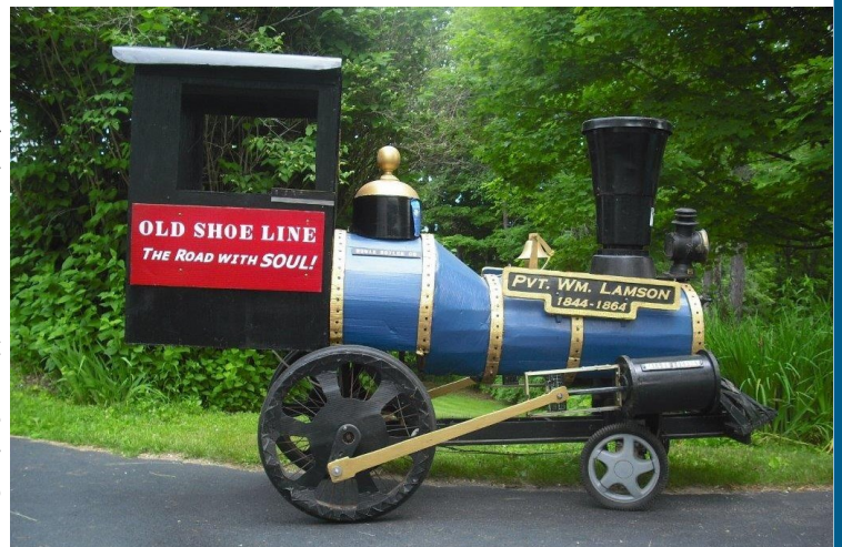
Donated Locomotive from Bill & Lois Soule

Bill mentioned that a feature which worked well was using a child's battery-operated soap-bubble generator/blower, hidden INSIDE the stack, to represent smoke. Even though the device didn't like the bumpy ride, it created a charming effect when it worked. For the Christmas parades, LED lights were attached and operated by battery. We may be able to use one or both of these ideas.