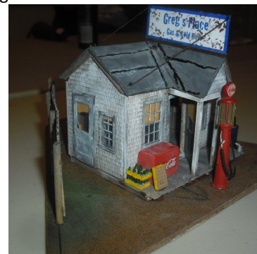
Greg Ouellette's weathered garage