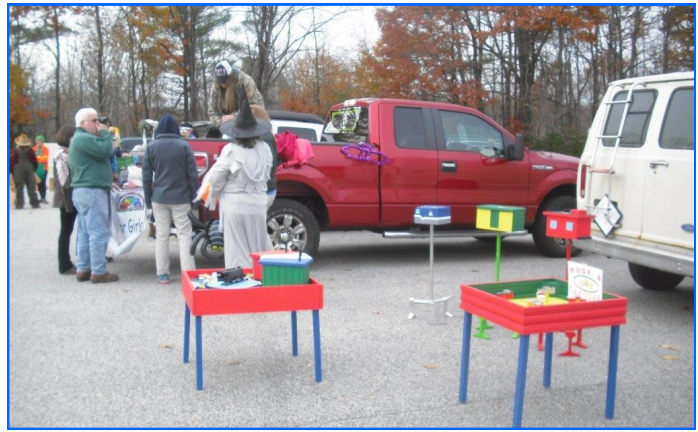
GFMRRRC was represented with games and candy at the Buckfield Trunk or Treat on Halloween night.

During the month of October several members of the G-Gauge Division have made improvements to the Thomas the Tank Engine layout. They put down a new base for the display and modified the cars to run through the bridgework on the layout. They have also installed a water-wheel which is interactive by pushing a button. Thomas the Tank Engine has always been one of the favorite attractions for the younger visitors to our special events, and we are