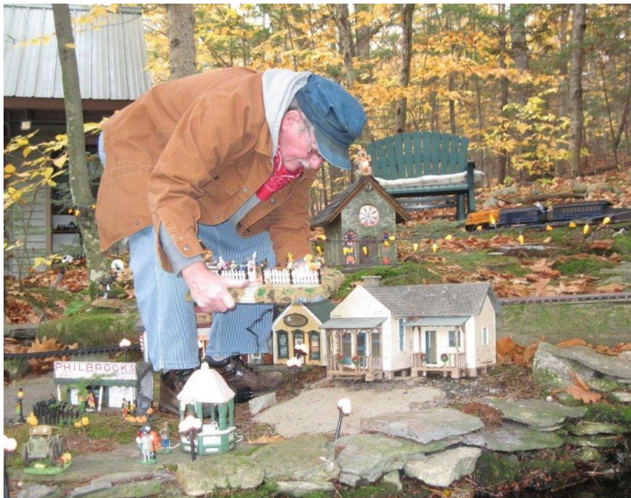
Dick Clark's annual Halloween Open House had a lot of new features.