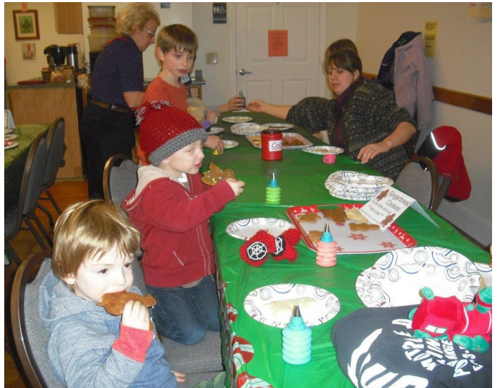
Craft Table at ExTRAINaganza 2014

Because of the number of days and the different activities going on at the event, club members are needed to help by taking charge of games, supervising craft and cookie tables, selling tickets, monitoring layouts, and teaching young "Guest Engineers" how to run trains.