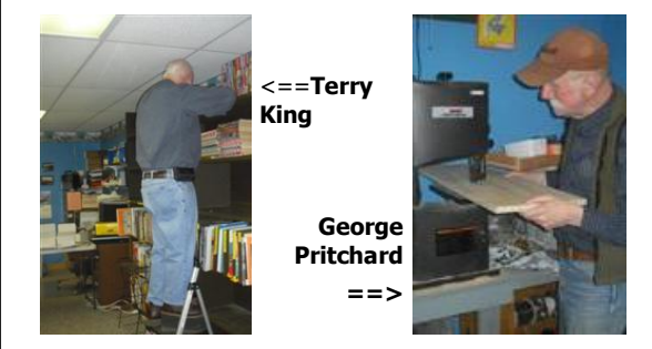
Library Shelves installation

The magazine section now has a more uniform look and nearly all cardboard magazine holders are white. The Model Railroader magazines are either bound or in Model Railroader binders.