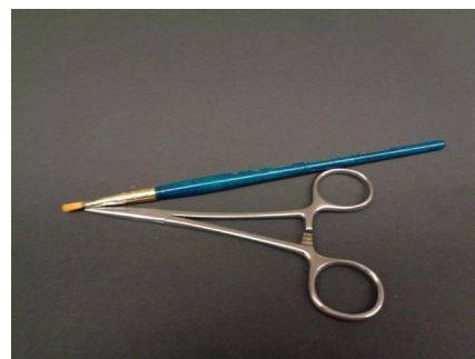
Scissors and paint brush for applying decals