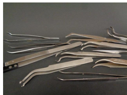
Tweezers & clamps