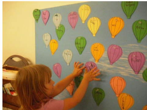
Miya Pelletier pins her balloon name tag

As they enter the club's facility for the Train Fest, children will write their names on small paper hot air balloons and add them to a painted backdrop scene.