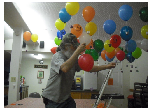
Balloons for festival preparations