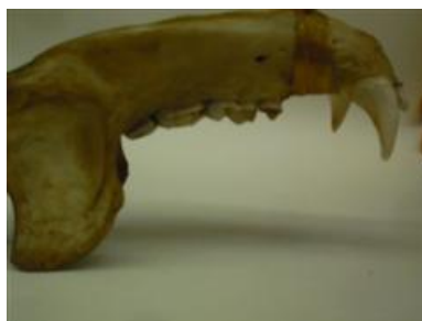
Thunder's bear jaw knife handle