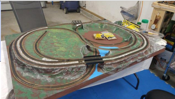
N-Scale Portable Layout