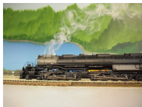
The second annual HO Steam Session was held on February 23. The next special event on the HO layout will be the Union Pacific Session on April 20, using only Union Pacific locomotives.

The more club members who participate, the more food selections we will have at the March club meeting.