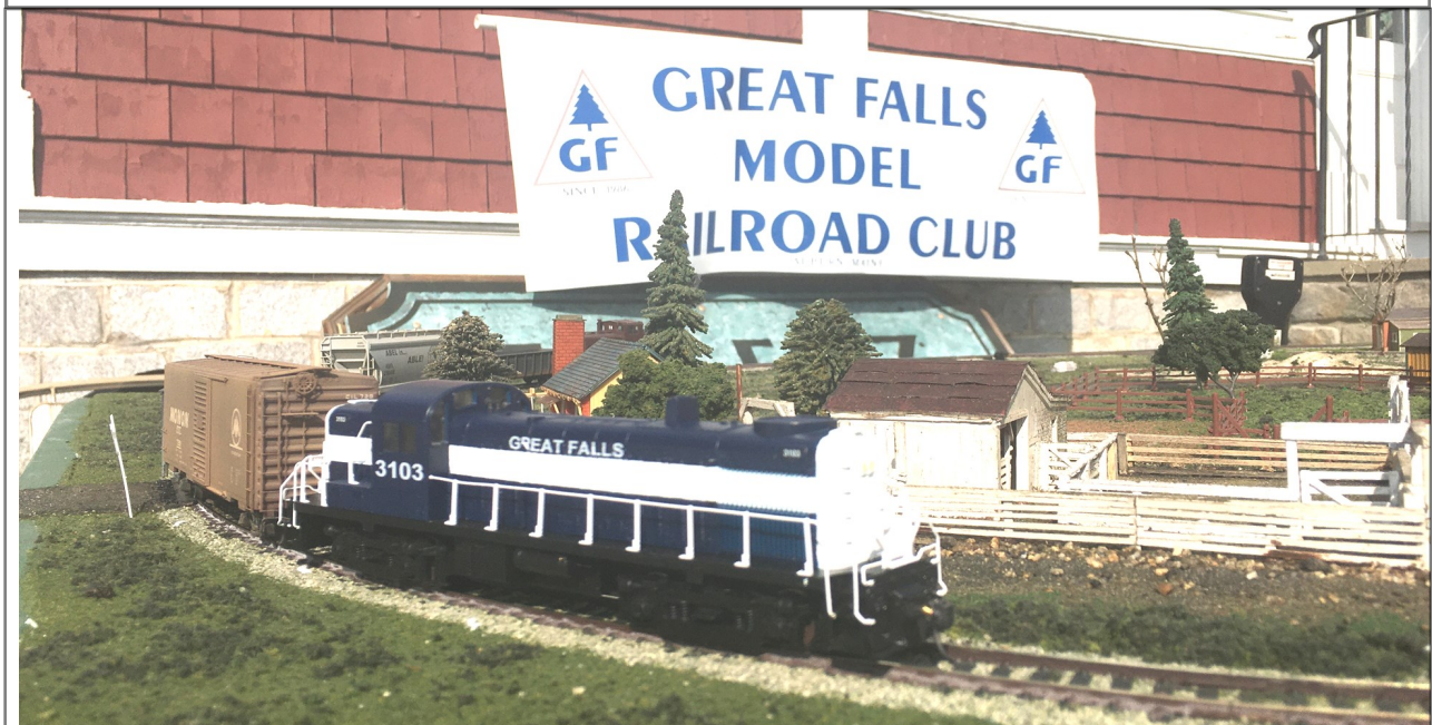
HO display layout at the ME Paper & Heritage Museum 10/9/21