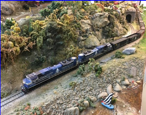
HO Scale Layout