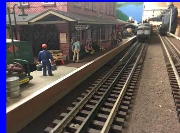
O Gauge Layout