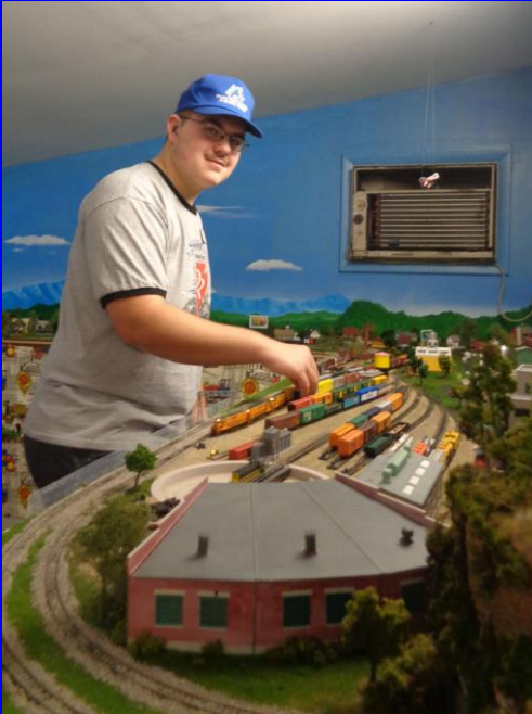
N Scale Layout