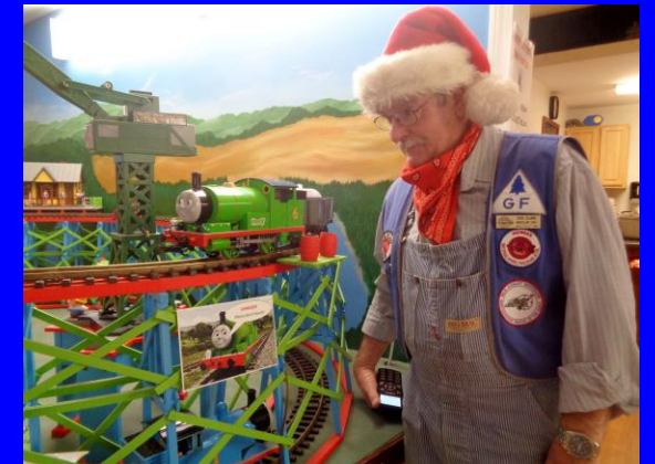
Thomas and Percy

The Great Falls Model Railroad Club membership is open to families, students, and individuals of all ages. The club is a 501(c)(3) educational foundation recognized by the Internal Revenue Service (IRS); therefore, gifts made to the club may be tax deductible.