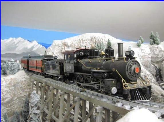
On the G Scale Layout