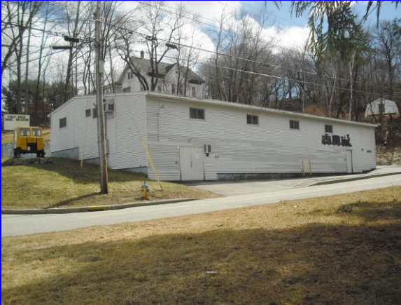
Our Clubhouse at 144 Mill Street