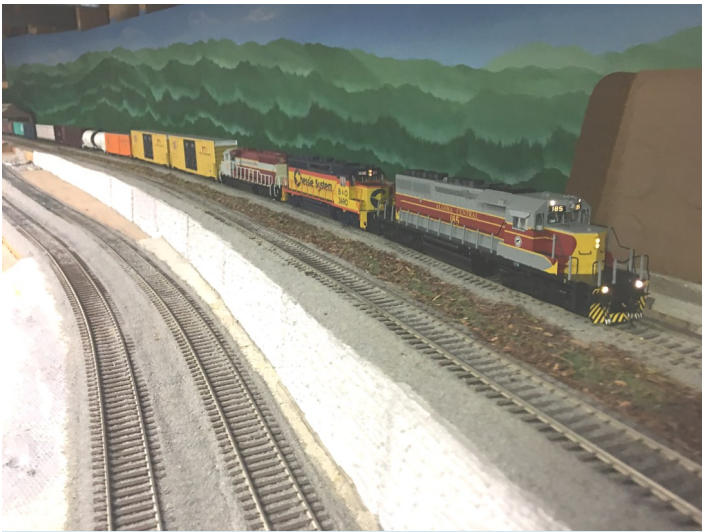
OBHC-X tackles the grade on the Mountain Sub.