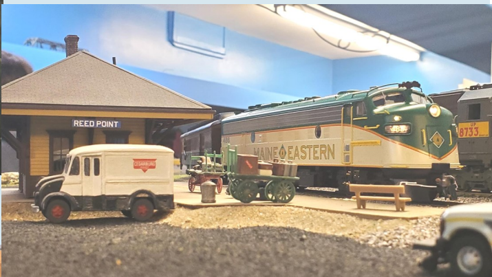
Maine Eastern 488 stands at Reed Point with an excursion train.

Model and photo courtesy of Benton Hayes