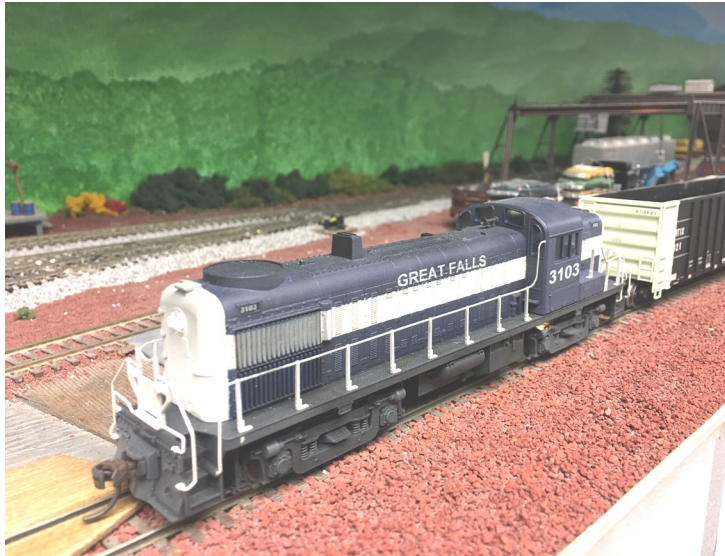
3103 filled in for the usual Thurston Switcher