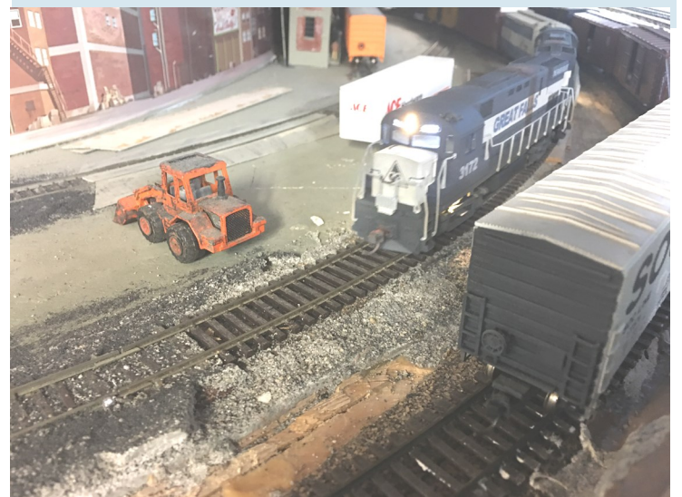
CPOB-X tiptoes thru the Warehouse District due to congestion on the main line