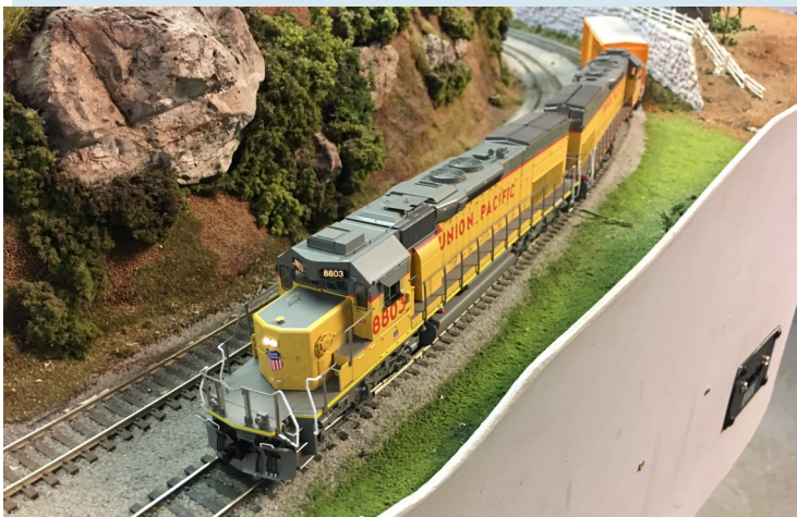
8803 and a sister switch Obie North

Model and photo courtesy of Benton Hayes