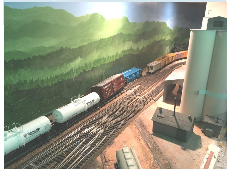
The crossovers at Riverton proved problematic for CPOB-X...