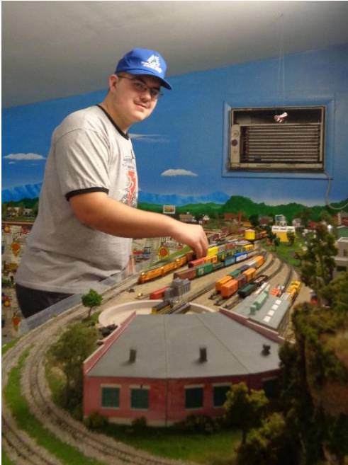
N Scale Layout