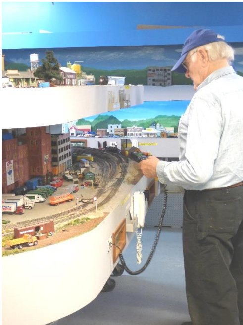
HO Scale Layout

The Great Falls Model Railroad Club meets monthly at 144 Mill Street in Auburn, Maine (see map for location). Check our website for the next meeting. Club meetings usually include a railroad video for the first thirty minutes, a business meeting, and helpful “how-to” clinics. Members share modeling ideas and techniques at the Modelers Forum on the fourth Thursday of the month. Construction on the permanent multi-level HO layout continues on Wednesday evenings and Saturday mornings, with operating sessions twice a month. Other members are continuing work on the club’s permanent N, O and G-scale layouts.