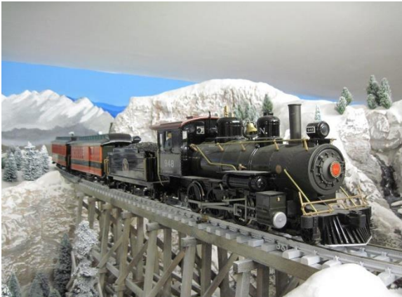
On the G Scale Layout