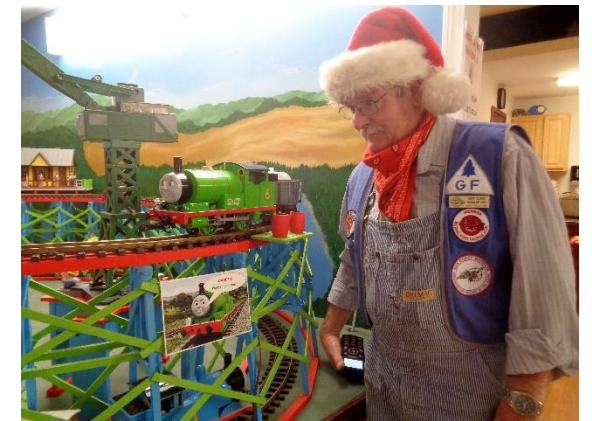
Thomas and Percy

The Great Falls Model Railroad Club membership is open to families, students, and individuals of all ages. The club is a 501(c)(3) educational foundation recognized by the Internal Revenue Service (IRS); therefore, gifts made to the club may be tax deductible.