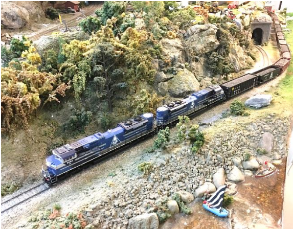
HO Scale Layout