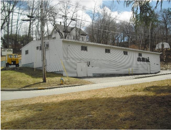
Our Clubhouse at 144 Mill Street