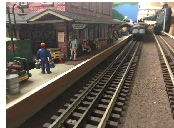
O Gauge Layout